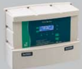
RPD Series 8